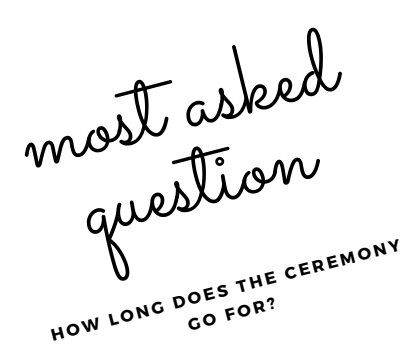
Average ceremony goes for about 25 min.